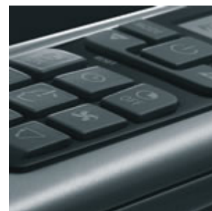
I - COMFORT REMOTE

Thanks to the temperature sensors fitted in both the remote control and the wall unit, the new I-COMFORT function, allows the user to choose whether they sense the temperature at the unit or at the remote control location. Switching between the two with the I Comfort button.